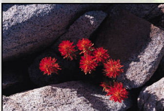
The Rock of my salvation