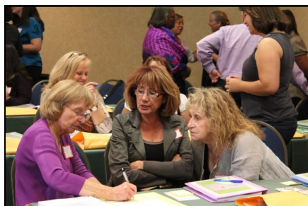
Collaborating with colleagues

Hands down, the most anticipated activity of the workshop is the time spent collaborating with colleagues. Hearing how another teacher handled a troubled child or getting advice from another director on how to confront an aggressive parent is