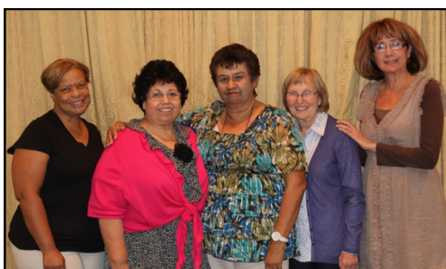
25+ years of service

If all the years of service were added together, the total would be overwhelming. So many of you have dedicated your lives to this